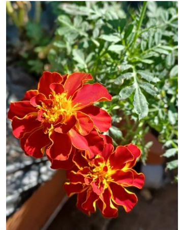
Left: Yarrow before plant stand with ornamental grass, geranium, loose leaf lettuce; Right: Marigold resurging after removal of cucumber plants