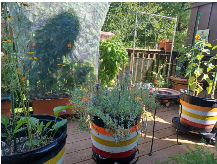
Getaway Gardens Late Summer 2024 (new blooms following deadheaded coreopsis, lavender, branching sunflowers; blooming dill)

The chill will be here before we know it, so get as much enjoyment out of your garden as possible. One way to do this is to make non-working garden visits routine. Throw on some sleeves, a sweater or jacket and have that morning coffee or tea in your garden, where you can reflect, relax, and plan your day. Better yet, enjoy your late afternoon or early evening with an herbal tea, cocktail or mocktail (using the last vestiges of your garden harvests where possible). Take this time to unwind, relax, and reflect. Bring along some tunes, a book, maybe a friend, family member, a snack or two. Be surrounded and delighted by the end of season flurry of pollinators and the birds' changing of the guard.