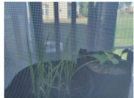
Left: Bee balm establishing itself (for spring return) as buckwheat winds down; Right: Green onions, fall bush beans