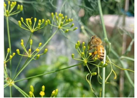
Left: Honeybee on tiger-eye sunflower bloom; Right: Honeybee on dill blooms