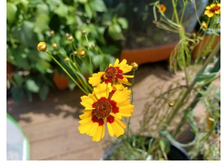
Left: A skipper drinking from black-eyed susan; Right: Budding and blooming plains coreopsis