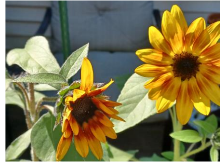
Left: Coneflower establishing itself for spring return; Right: Late season tiger-eye sunflower blooms