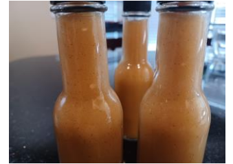
Habanero pepper sauce batches (Summer Mango, Caribbean Mango)