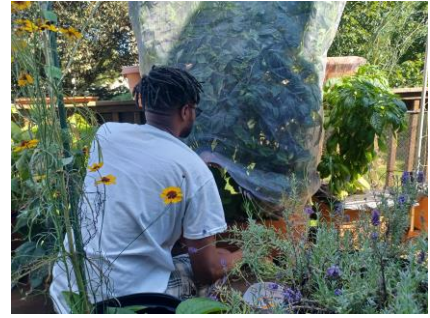
Left: Habaneros, habaneros everywhere; Right: Harvest visit from Mr. Getaway Gardens himself