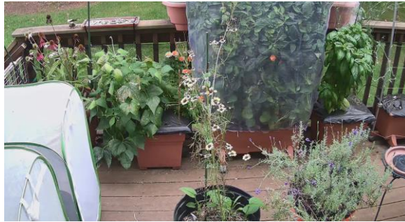
Goldfinch (upper left) enjoying its offering (drying sunflower head) after deadheading