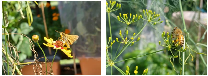
Left: Skipper butterfly (Sachem) on plains coreopsis bloom; Right: Honeybee in dill blooms