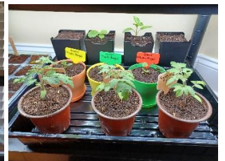
L: Seedling in coir blend, Burpee Self-Watering System; C: Seeds in coir pellet mixture, and organic seed-starting mix; R: Seeds repotted in 4 in pots, organic potting soil